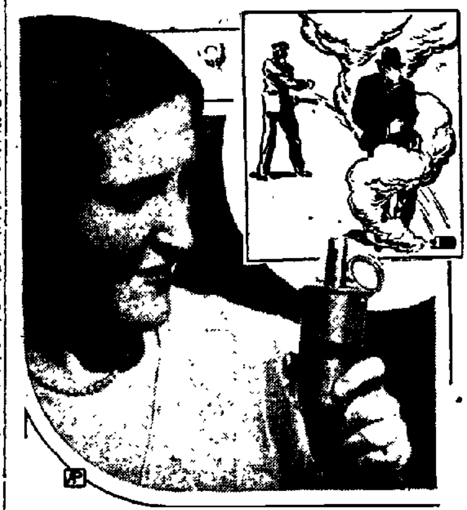
Bandits do not have to go to sea to become seasick now. If they inhale the fumes from a new bomb developed at Pittsburgh, Pa., they will become nauseated and go through all the experiences of seasickness. The grenade, containing solid matter which turns to gas when it hits the air is shown above.

"These high powered speed grenades also lend themselves to selective treatment of crime. If it is intended only to put the bandit out of commission for 15 to 30 minutes, tear gas is used but if it is necessary to extend the period of unconsciousness to hours, the sickening gas can be used, which causes nausea and vomiting for five to six hours. Neither gas however leaves any permanent injury."